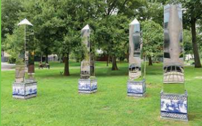
Temporary art installation at Rufus King Park