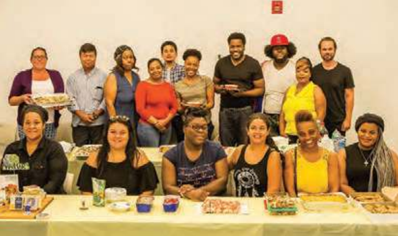
Students of the Jamaica FEASTS program