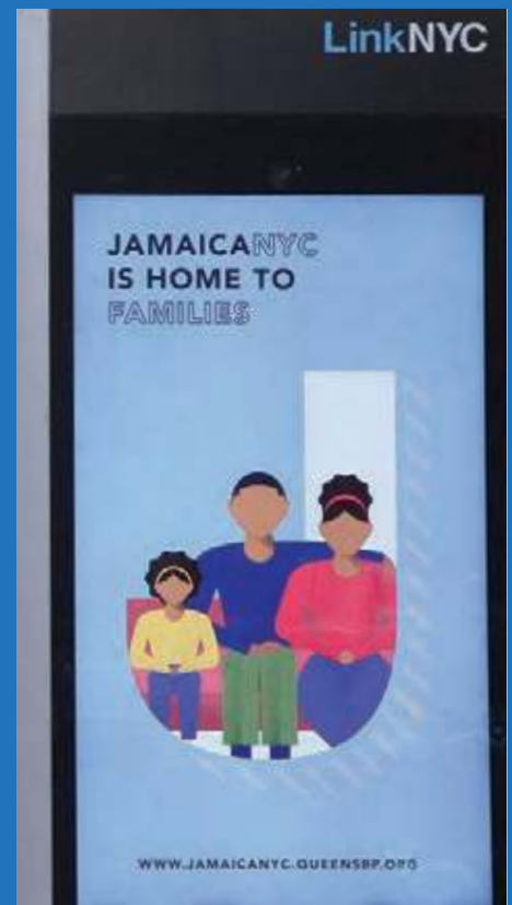
Example of “Jamaica Is” marketing campaign in LinkNYC kiosk