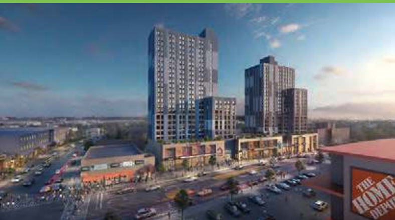
Rendering of new Archer Green affordable housing development

“Jamaica’s diversity, close-knit neighborhood fabric, and anchor institutions provide a strong foundation for tremendous growth and opportunity.”