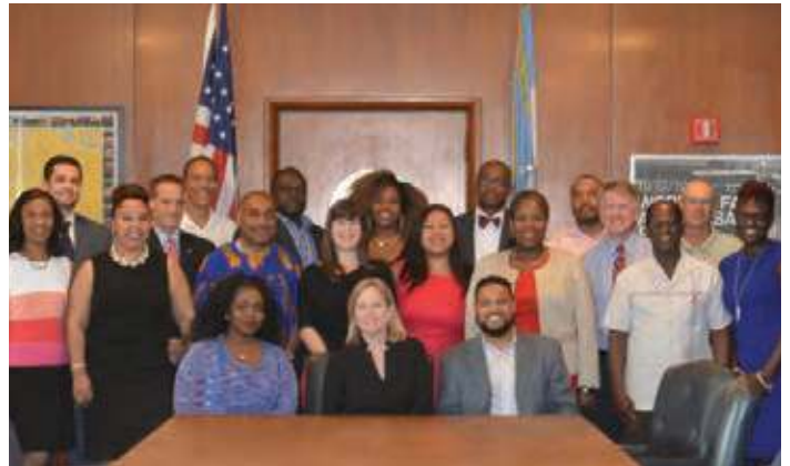
Jamaica NOW Leadership Council – 2018

The Jamaica NOW Neighborhood Action Plan focused on four core goals —increasing access to quality jobs and small business support; promoting commercial growth and economic development; improving livability; and increasing awareness of Jamaica through marketing efforts. The following provides key updates on the progress that has been made to date.