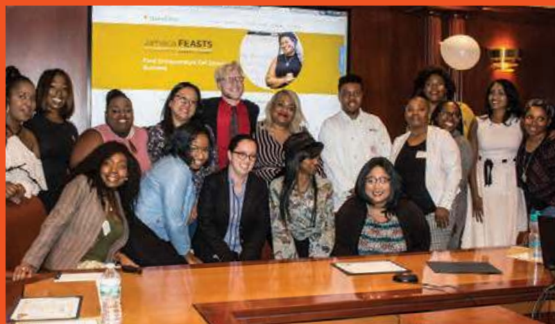
Jamaica FEASTS Graduation Ceremony