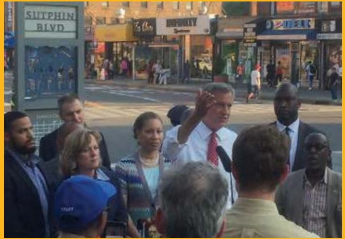
Mayor de Blasio discussing City investments in Jamaica on Sutphin Boulevard.