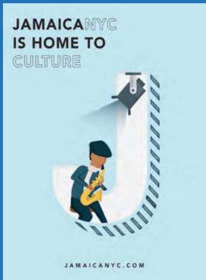
Examples of "Jamaica Is" marketing campaign, which ran across the city in July of 2019