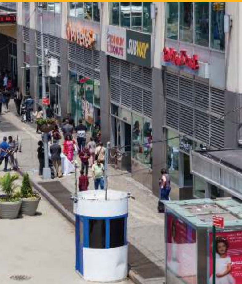
Street improvement and new pedestrian plaza in Downtown Jamaica