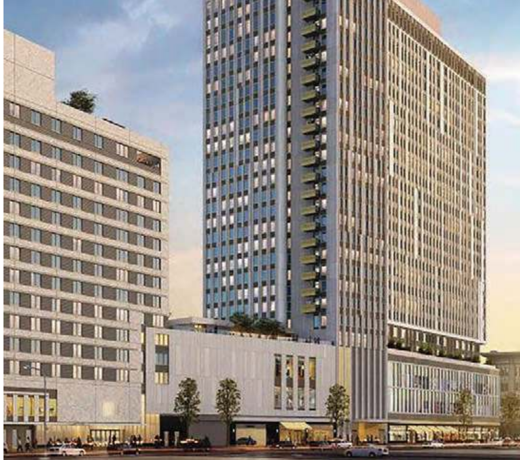
Rendering of The Crossing at Jamaica Station, a new mixed-use residential development at Archer Avenue and Sutphin Boulevard

Jamaica is also a major commercial business district and transportation hub with regional connections. Served by more than 50 city and regional bus lines, four subway lines, 10 LIRR lines, and the AirTrain to JFK International Airport, transportation has been key to Jamaica's growth and connectivity.