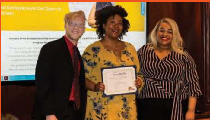
Graduate of Jamaica FEASTS program

“Thriving small business corridors help foster vibrant neighborhoods across our city.”