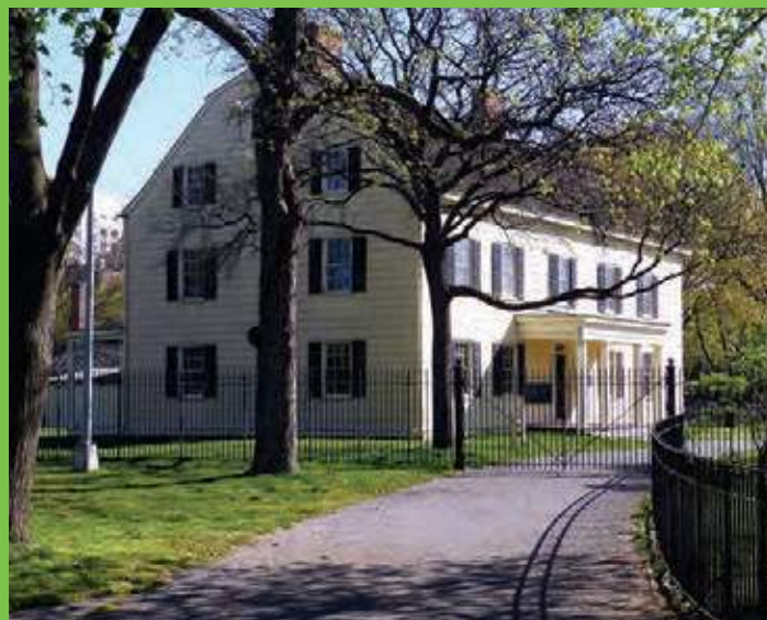
Historic King Manor, which was rehabilitated as part of the Action Plan